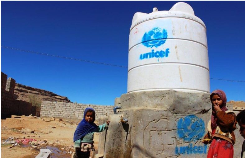
(Sa'ada water corporation)